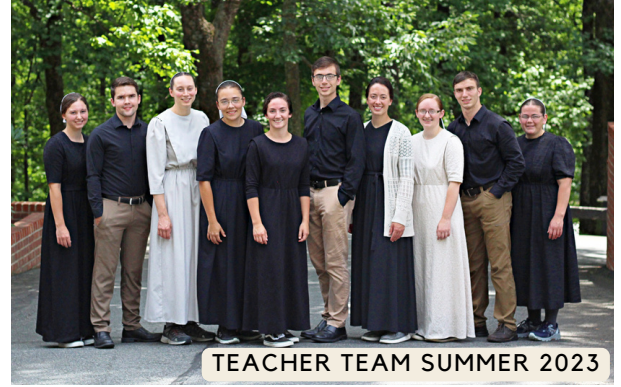
TEACHER TEAM SUMMER 2023