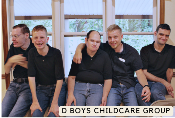
D BOYS CHILDCARE GROUP